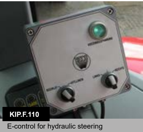
KIP.F.110 E-control for hydraulic steering