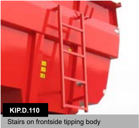
KIP.D.110 Stairs on frontside tipping body