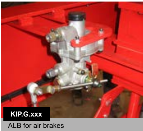
KIP.G.xxx ALB for air brakes