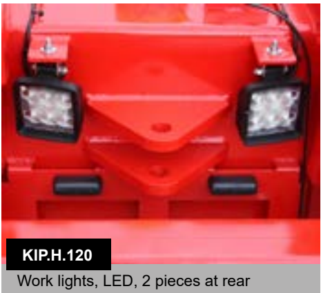
KIP.H.120 Work lights, LED, 2 pieces at rear