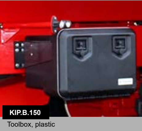
KIP.B.150 Toolbox, plastic