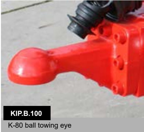
KIP.B.100 K-80 ball towing eye