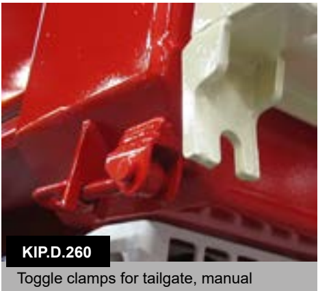
KIP.D.260 Toggle clamps for tailgate, manual