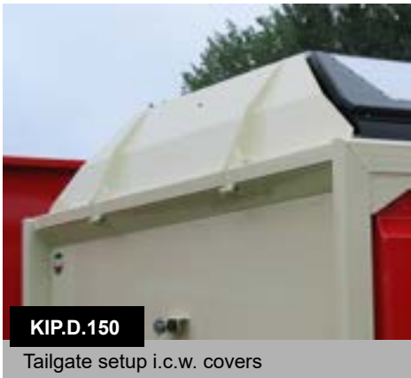
KIP.D.150 Tailgate setup i.c.w. covers