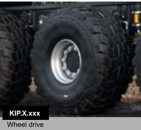
KIP.X.xxx Wheel drive