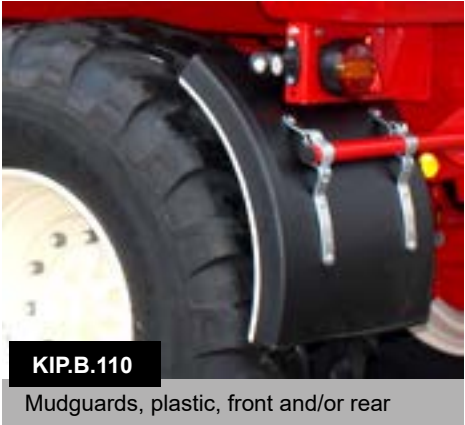
KIP.B.110 Mudguards, plastic, front and/or rear