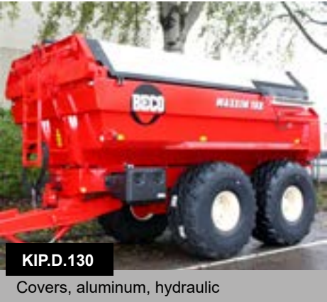
KIP.D.130 Covers, aluminum, hydraulic